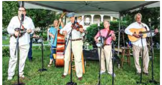
The Dismembered Tennesseans had everyone tapping their toes!