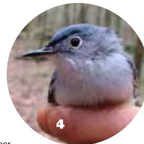
Birds banded at the Bird Observatory this year: 1- Connecticut Warbler, 2- Indigo Bunting, 3- Kentucky Warbler, 4- Blue-gray Gnatcatcher The whiteboard at the banding lab shows a list of 42 species banded between April and June of this year.

Next to the Bird Observatory itself, the Trust's stewardship interns have been hard at work this summer completing two primitive cabins and two camping pads. These cabins/pads will serve as housing for educational groups during field trips as well as for eco-tourists who wish to donate to the Bird Observatory in exchange for the opportunity to experience bird-banding firsthand in an overnight weekend adventure.