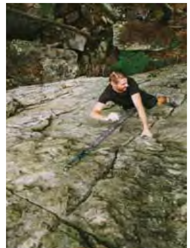
Castle Rock, a renowned rock climbing venue, has been preserved through a unique conservation partnership.

The Southeastern Climbers Coalition have worked diligently to mark and equip Castle Rock with nearly 100 sport and traditional climbing routes. The crag is known for having one of the hardest routes in Tennessee — Apes on Acid 5.13d — offering a challenge to even advanced climbers.