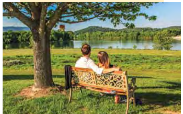
Watching the river roll by.

Mark your calendar for next year: May 12, 2016