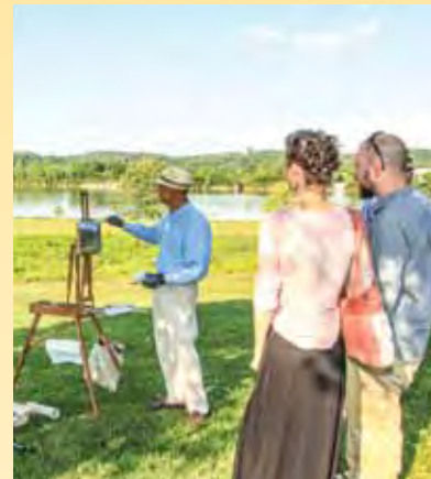
Guests enjoyed watching artists painting "en plein air."