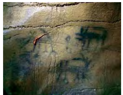
This shape-shifting dog charcoal drawing dated at approximately 700 years old is located in an unnamed cave in the Tennessee River Gorge. A cave salamander can be seen admiring the ancient artwork.